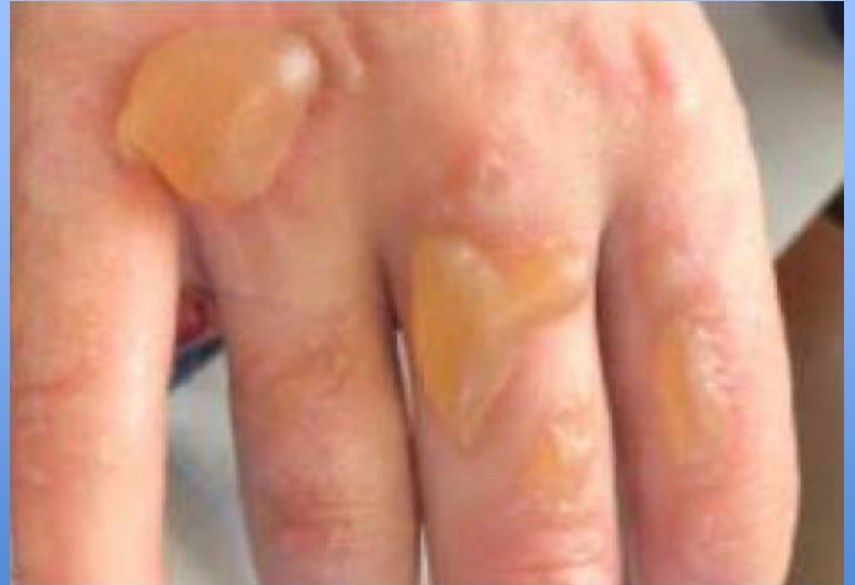
Employee receives first and second-degree burns to both hands from applying hand sanitizer before touching a metal surface.